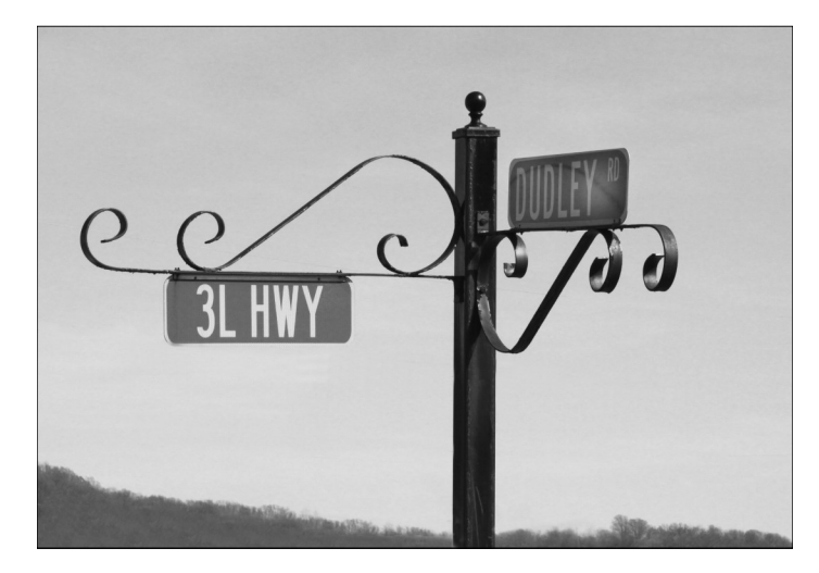
One of two signs remaining in all of Kenton County designating Madison Pike (Route 17) as the "3L Highway."

By 1932, Kenton County's portion of the LLL Highway had become State Route #17 and much of Pendleton County's part had become US 27. Suddenly the ever-popular LLL Highway was gone forever. Today, only a short stretch of roadway running parallel to US 27 in Pendleton County, just south of Falmouth is still officially signed "Old LLL Highway."