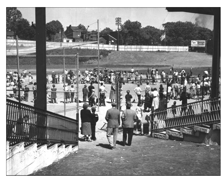
Covington Ballpark circa 1950. This baseball arena and grandstand stood in the Willow Run valley near today's 9th and Philadelphia Streets, Covington.

Once a clear, quickly-flowing waterway, parts of Willow Run ran dry by the early 1900s, mostly due to neighboring development, and many sections, in-