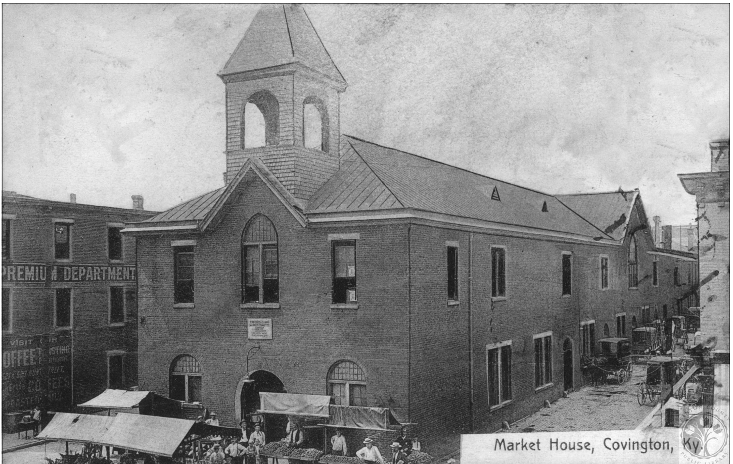
Seventh Street Market House