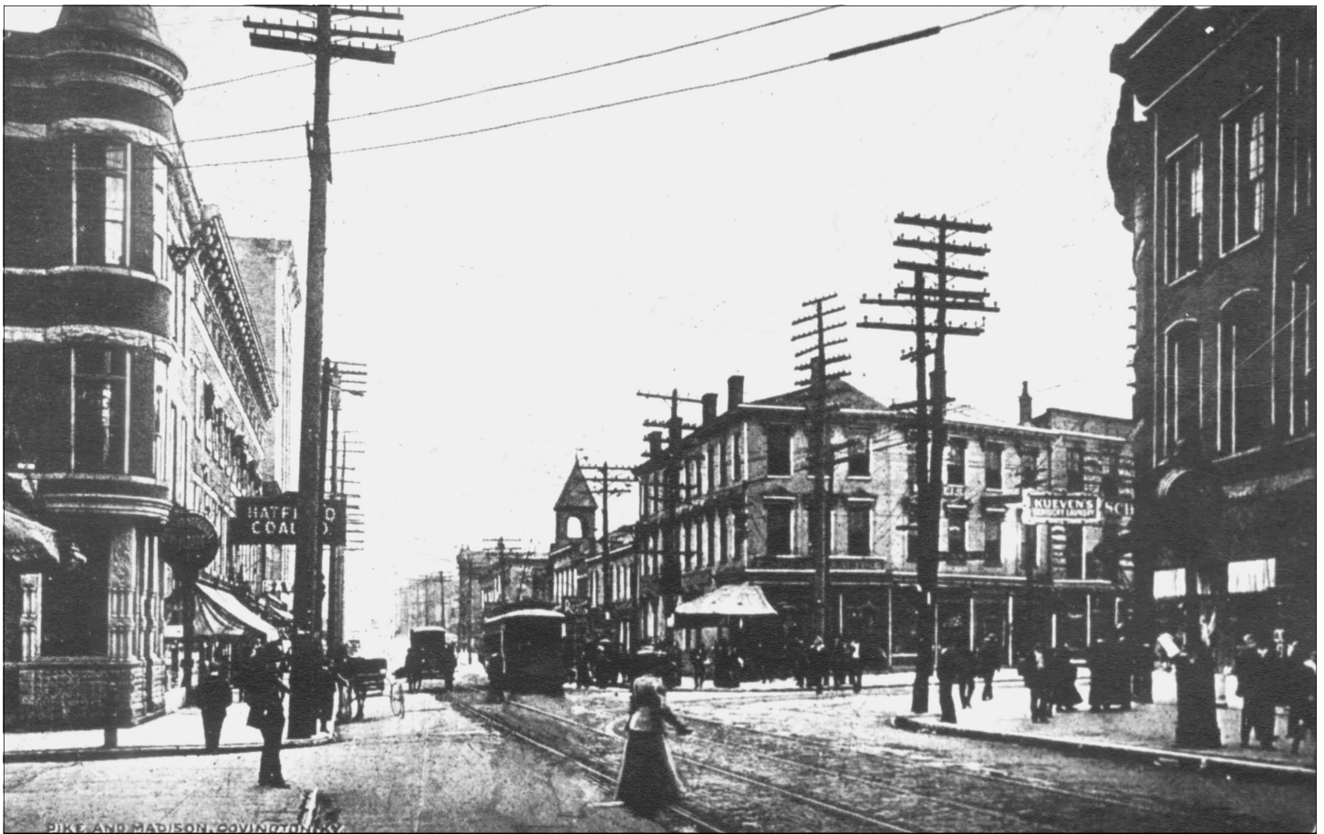
Old southwest corner of Pike and Madison where Perkins and Company operated