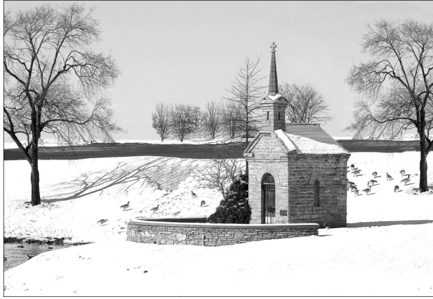
Monte Casino Chapel at its original location in Covington, circa 1920, and at its present location on the campus of Thomas More College

Left photo courtesy Kenton County Public Library. Right photo courtesy Bob Webster.