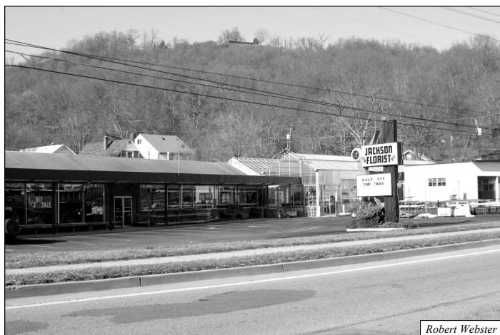
Above: Quite possibly Kenton Vale's most familiar landmark, Jackson Florist, located at 3124 Madison Pike.