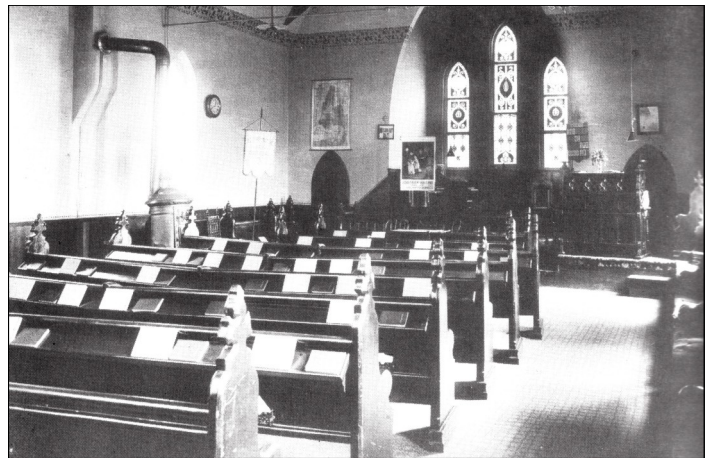
Interior view of the original Episcopal Church in Milldale.

In 1867, Trinity Episcopal Church, downtown Covington, established a mission in Milldale (Latonia), and a wooden chapel was opened at the southwest corner of Southern Avenue and Church Streets. Services began the following year on February 13. It was generally staffed by the rectors of Trinity Church, Covington. 4 The establishment in 1883 of one of the finest courses in America, Latonia Race Track had brought vigorous commerce to the area during the spring and fall meets. The mission flourished for a time, providing an Episcopal presence in the town, but in 1890 it was sold to the Meth-