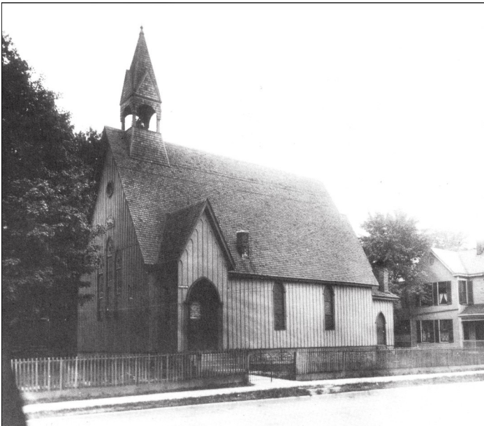
Original wooden-structure Episcopal Church in Milldale (Latonia). In 1890 it was sold to the Methodists.