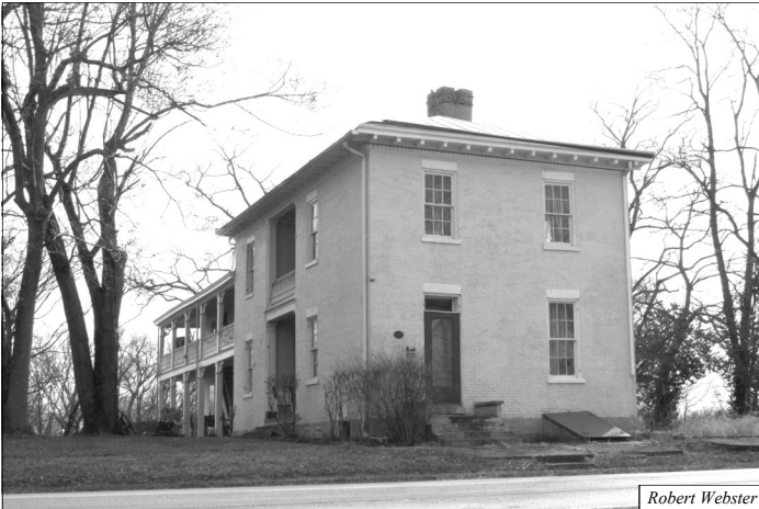
Above: the Oxley House, Right: the Metcalfe-Stephens House, both located in the 5200 block of Madison Pike, Independence.