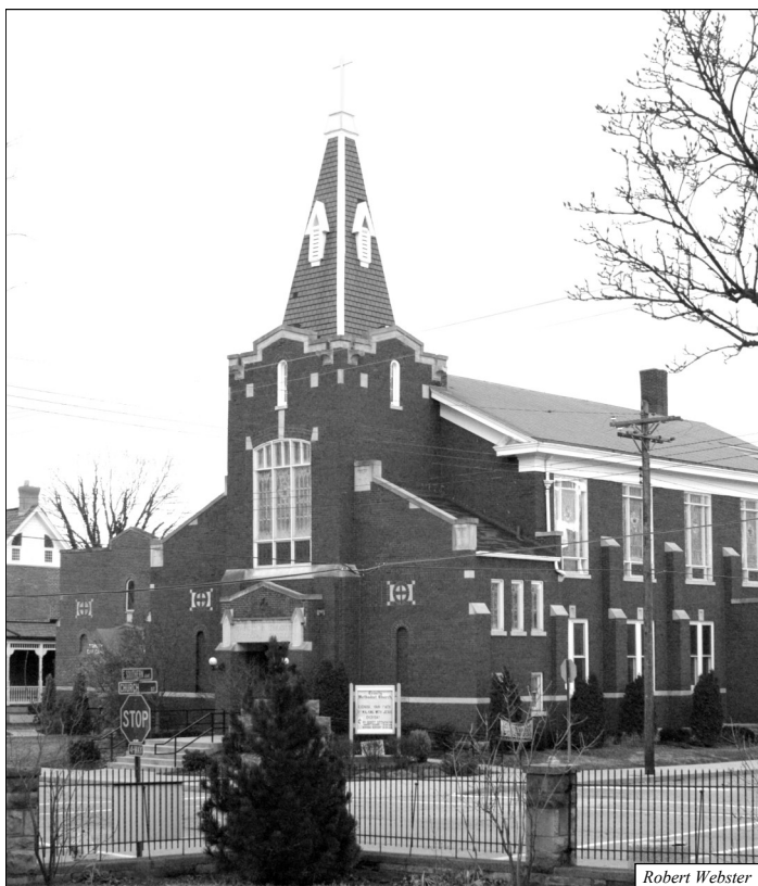
New church replaced original wooden structure.

Henry Feltman spearheaded the funding of the new structure, giving $5,000 as a base for the building fund. 8 Church records show Mr. Feltman initially gave twice that amount. He also pledged matching funds for all other donations to the project. The total cost of the new edifice was $25,000. The new church was dedicated April 9, 1911.