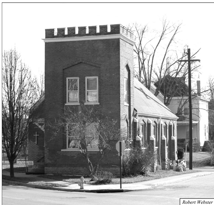
St. Stephen Episcopal Church, Latonia (now vacant)