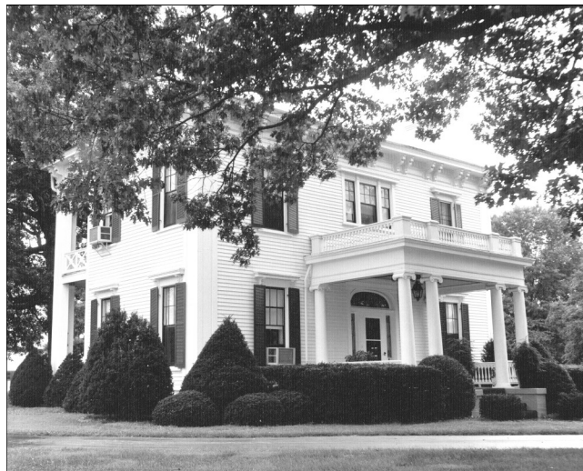
Winston-Feltman House in Taylor Mill, razed under much controversy recently. A complete article is underway for an upcoming issue of Northern Kentucky Heritage .