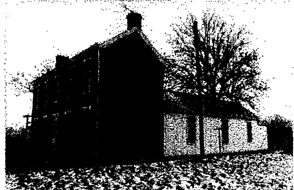
Kuchle Homestead (1910) showing brick addition – still standing at Kyles Lane and Dixie Highway.

The funeral procession then proceeded to the Fort Mitchell cemeteries. As the entourage passed the blacksmith shop, work stopped, all hats were tipped, and respect was paid to the dead.