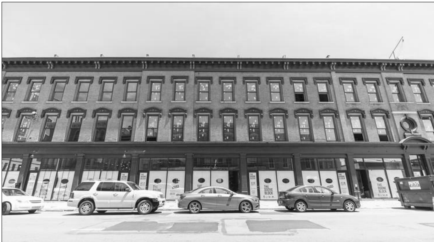
Photo taken during the transformation of Covington's historic Boone Block. The project was completed in 2017.

John R. Coppin's Building: A 110-room boutique hotel is now open in the former seven-story Coppin's Department Store at 7 th and Madison Avenue, Covington. A history of