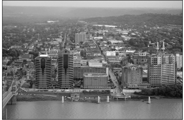
Covington's riverfront in 1982 and present-day