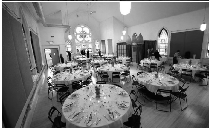
Top: Interior of a unit at St. Anthony Lofts, Bellevue