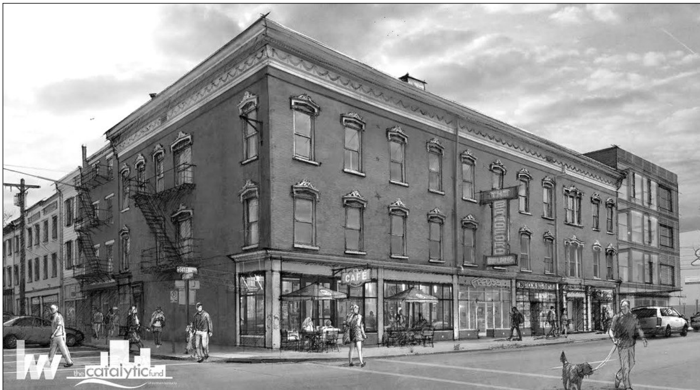
Artist's rendering of the completed renovation of Covington's Bradford Building.

Green Line Carbarn, Newport: The new Riff Distillery is planning a $7.5 million project to renovate the historic building and build a new structure as well that can store bourbon and rye whiskey with office space.