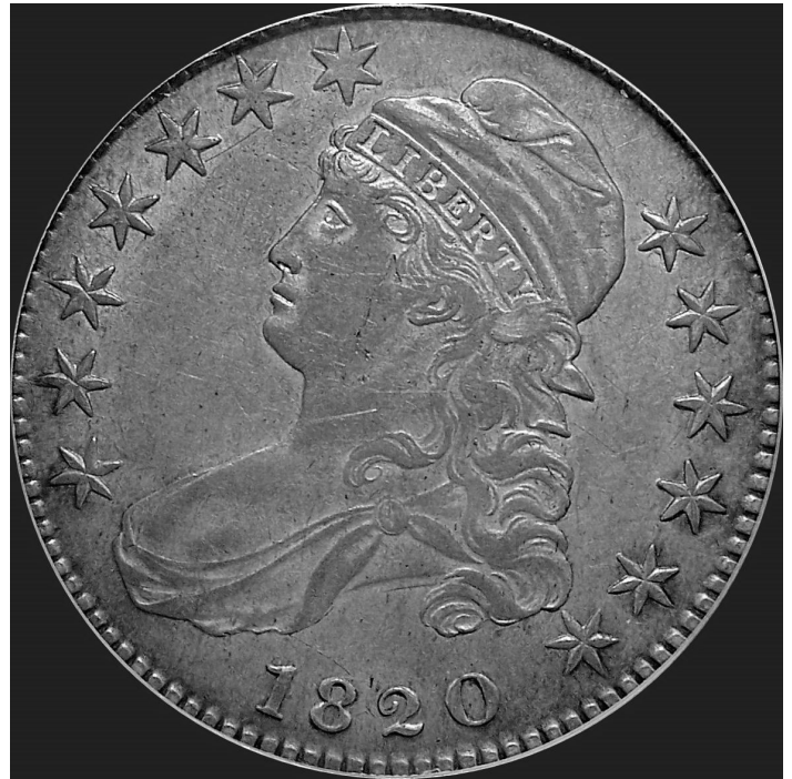
Lafayette's 1820 Coin

During 1824, the Congress of the United States made a request to President Monroe that he invite the Marquis De Lafayette to visit the United States. He arrive in New York on the 13th day of August. He visted every state and most of the large cities. On his way from Lexington, Kentucky to Cincinnati, Ohio, by