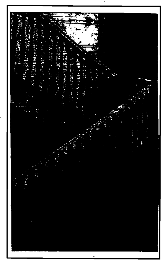
An ornatestaircase that now leads to an empty floor.

In 1916, the hall served as the temporary home of the First Baptist