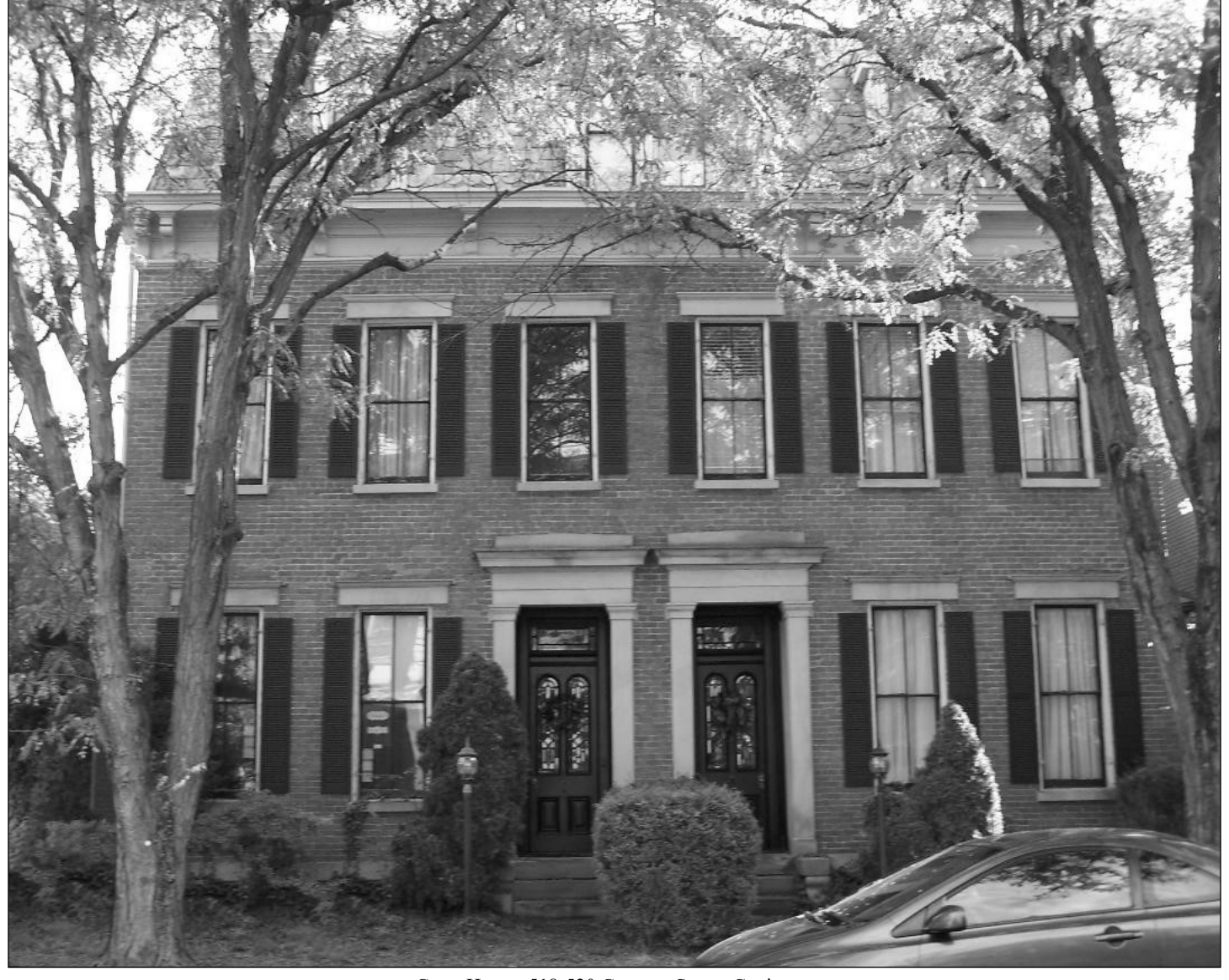
Grant House, 518-520 Greenup Street, Covington