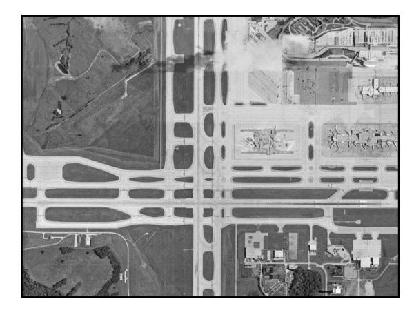
Left: Boone County Airlines in approximately 1945. Right: Just a small portion of the tremendous acreage of the Cincinnati Northern Kentucky International Airport in 2019.