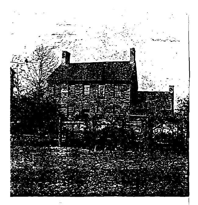
Kennedy Stone house, 1895