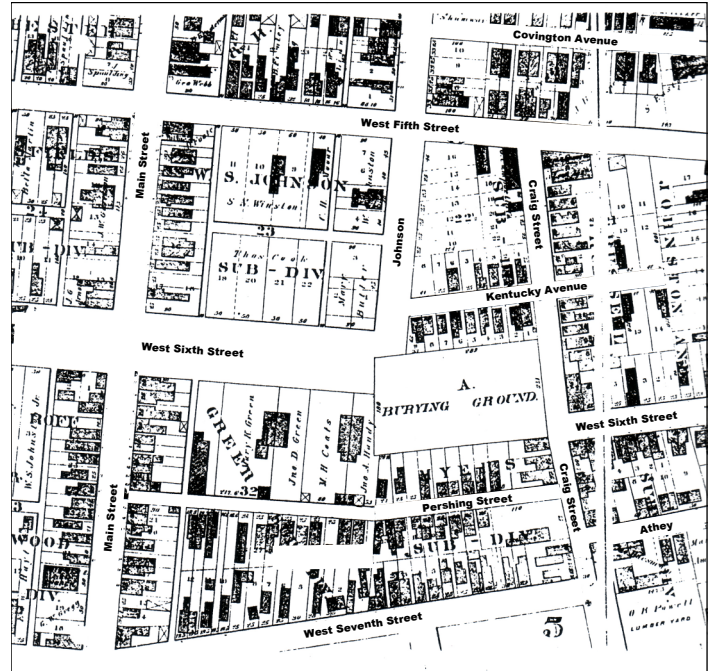
Craig Street Burial Ground shown on 1851 map of Covington

In 1835, the Western Baptist Theological Institute purchased approximately 150-acres south of