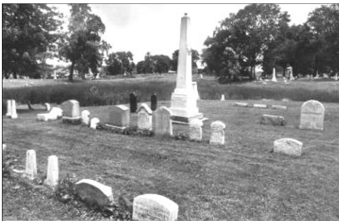
Covington's Historic Linden Grove Cemetery