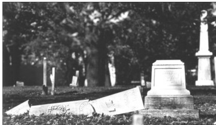
As early as the late 1850s, random acts of vandalism took their toll on the historic cemetery.

Methodist churches in Covington. According to newspaper accounts, the new cemetery was, “60 acres of high table land, overlooking the city of Cincinnati and situated in the midst of the most quiet and romantic scenery.” Another reporter stated, “A place like this, in the vicinity of Cincinnati, would be thronged with the admirers of nature and art thus happily combined.”