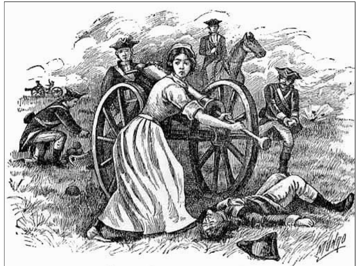
Early drawing of Molly Pitcher titled, "At the gun"